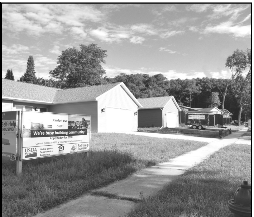
In August, Reedsburg will have 5 new homes on the tax roles!

Going forward, however, HFHWRA will not offer the Self-Help program with its requirement that we find 5 qualified applicants each “round.” We will return to working with families one on one.