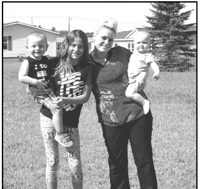
Meet our 2018 Partner family!