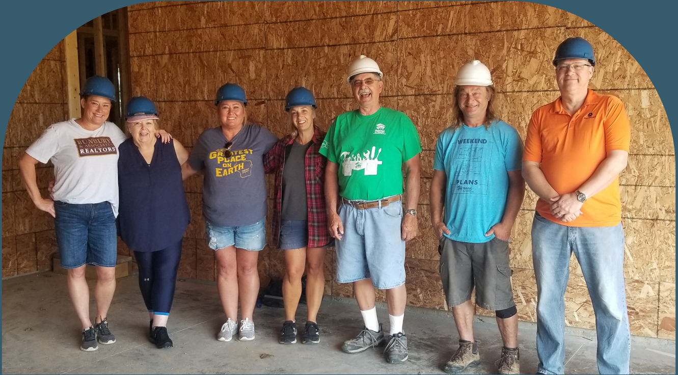
Habitat for Humanity of Wisconsin River Area